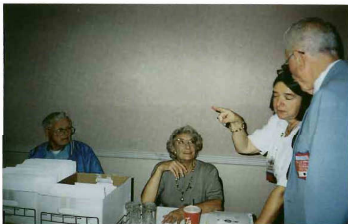
"And furthermore; if you don't like it, There's The Door!"