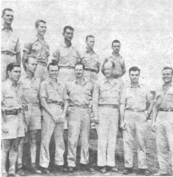
CREW OF B-29 ENOLA GAY, WHICH DROPPED FIRST A-BOMB ON HIROSHIMA, AUG. 6, 1945; COL. PAUL TIBBETS JR. (FRONT ROW, 2ND FROM RIGHT) WAS COMMANDER