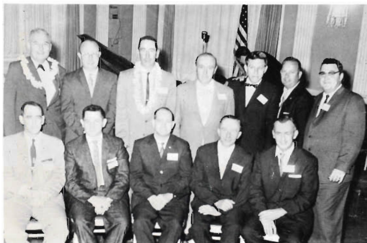
One of the best parts of our Association is the way Regional and Unit Chapters are organized within the parent TARO LEAF fraternity. Here are some 21st Infantrymen at Louisville last summer. (2-12)