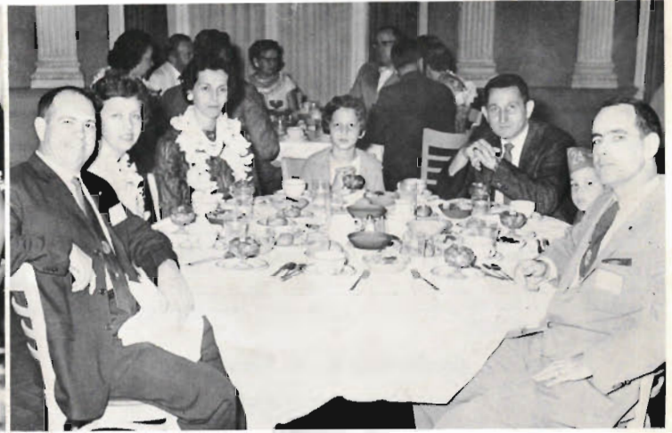
As always, our Saturday Night Banquet was made especially pleasant by family participation---as in above two table groups. (4-9) (4-4)