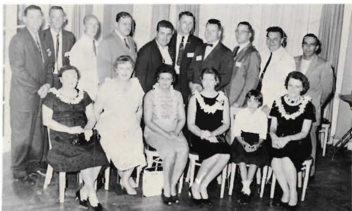
Within our Division Association there are unit groupings. Here are some 19th Inf "Chicks" at the reunion---though a number of others present are not in this picture. (2-9)