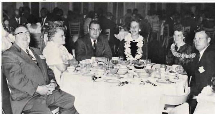
Everybody had a good time. (1-10)