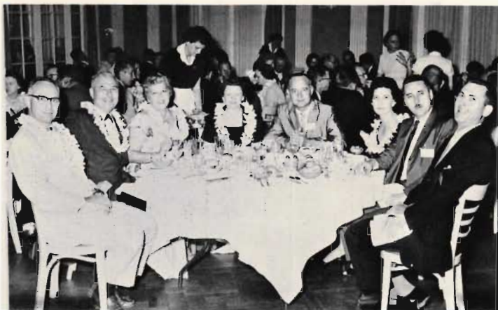
Note the flower leis, air mailed from Hawaii. These are a regular feature of our reunions, and give our banquets an especially festive air. (3-1)