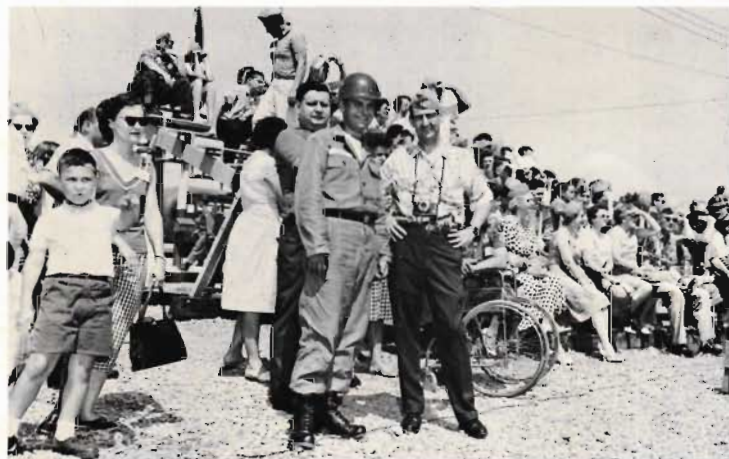
On the tour at Fort Knox, home of The Armored School, our Association members (above) witnessed firing "for record" at Heins Range.