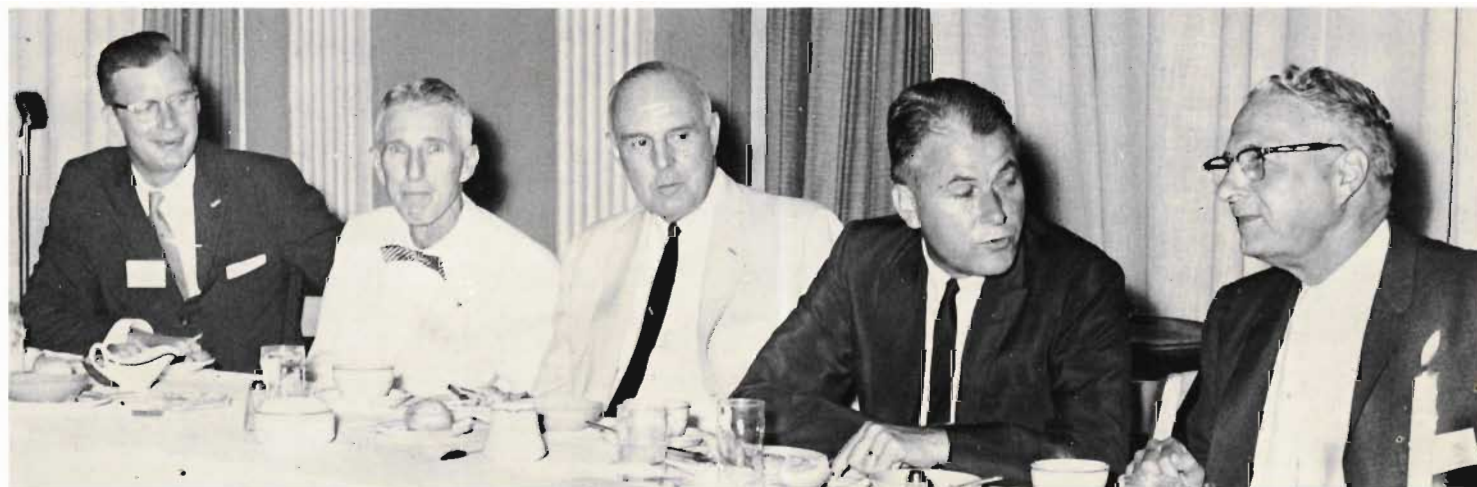
WHAT IS GOING ON HERE?...see top next page.(3-3)