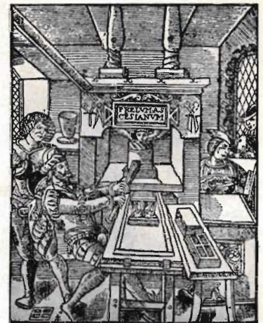
Typical Seventeenth Century Printing Office

History teaches the student facts of past ages but seldom does one have the opportunity to see direct connections with our world today. In the ink of this page one can see clearly the image of the master craftsman who some 500 years ago applied ink to the pages of the world's first printed works.