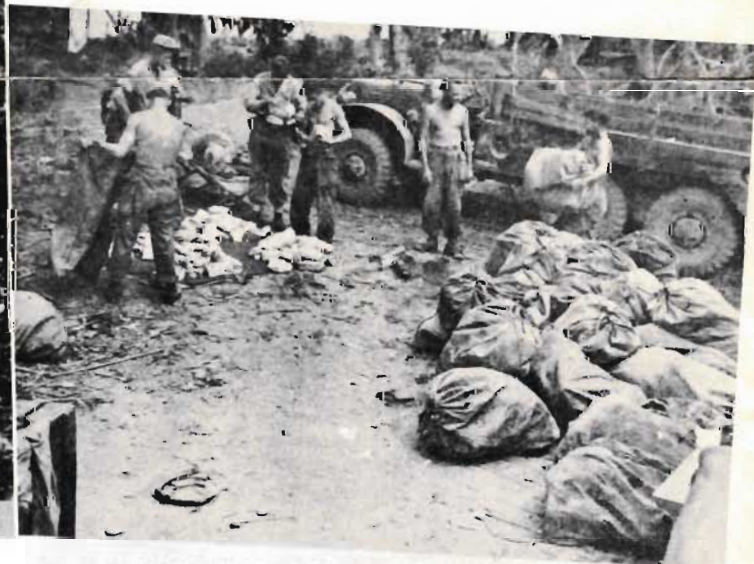
Mail for the Gimlets, 4 November 1944 on Leyte.