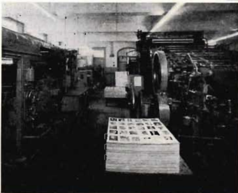
The modern presses of Hieronymus Muehlberger, established in 1470, which today prints the TARO LEAF.