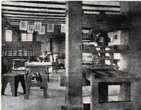
Gutenberg's workshop, as reconstructed by historians, typifies the print shops of the period when Erhard Ratdolt began printing in Augsburg.

From the hand operated presses of the fifteenth century to the giant modern presses which turn out by the hundreds the paper that you are now reading one may draw a very real picture of printing history. The TARO LEAF is produced every week by the oldest existing printing firm in Germany and pos-