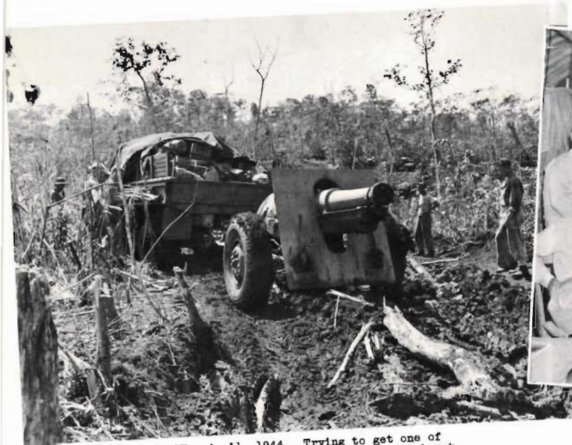
TANAHMERA BEACH - April, 1944. Trying to get one of General LESYER'S M1917 155 MM Howitzers off the beach.