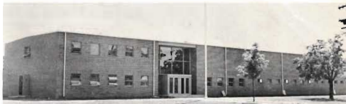
ROBERT B. CHAPMAN ARMY RESERVE ARMORY, DANVILLE, ILLINOIS