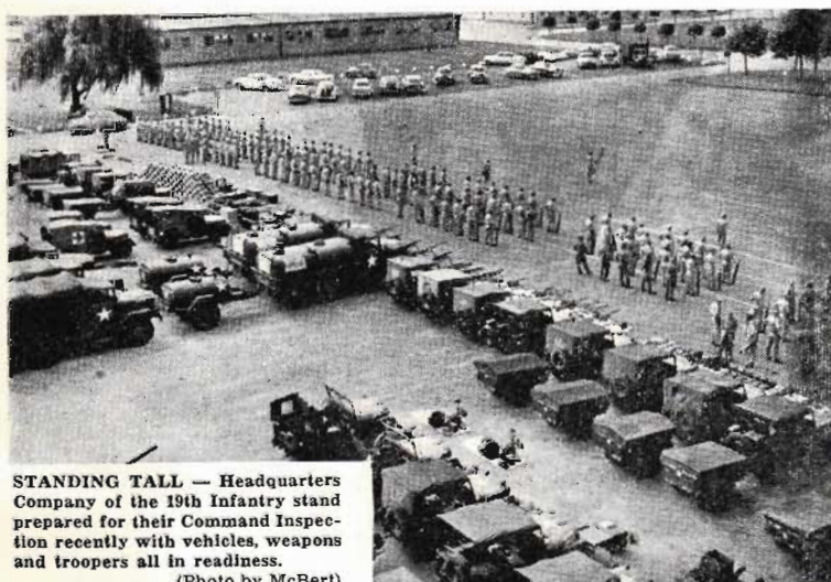
STANDING TALL -- Headquarters Company of the 19th Infantry stand prepared for their Command Inspection recently with vehicles, weapons and troopers all in readiness.