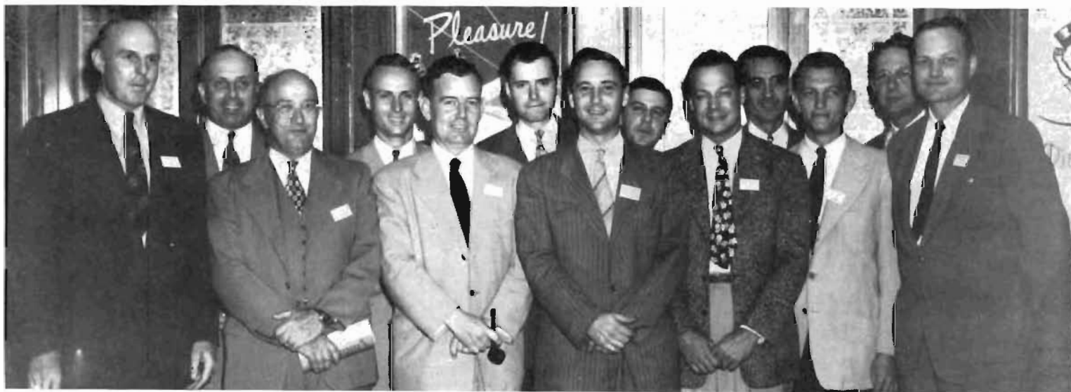
HEAVY BRASS FROM AROUND DIV. HQS.