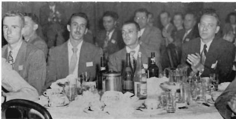
GROUP FROM THE 34th—WITH REFRESHMENTS