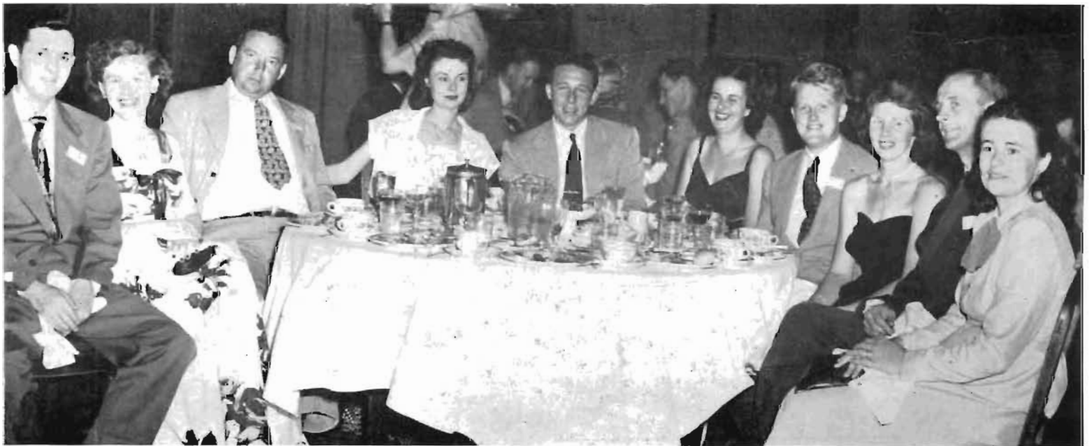
Gallant Gimlets and Their Glamorous Gals at Convention Banquet

General view of festivities at climactic banquet of 1st annual convention