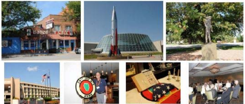
Omaha Marriott Hotel, Omaha, NE September 18-22, 2014