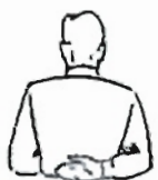
Illegal forward pass